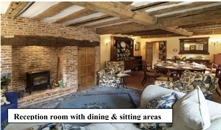
Reception room with dining & sitting areas

The Tallow Factory is the perfect place to unwind and experience life in an English village. It is located right in the centre of Dedham opposite the village church, a short walk from shops, pubs and lovely walks. It feels more like home away from home than a self catering cottage. With two large reception rooms, there is plenty of space for guests seeking convivial company or quiet recreation