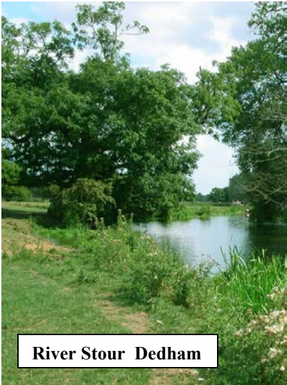
River Stour Dedham

Spacious Self Catering Cottage, Centre of Village, Charming Walled Garden with Summerhouse, Tranquil Courtyard Setting off High St , opposite Church, Riverside walks 5 minutes away, 2 Reception Rooms, 5 Bedrooms, 3.5 baths One hour by train to Liverpool Street: 30 minutes to the Essex and Suffolk Coast